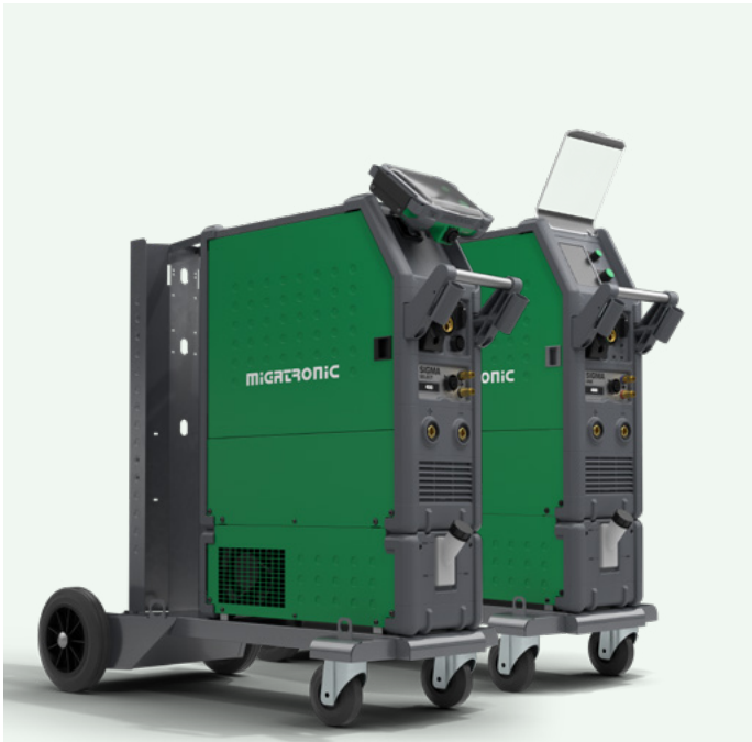
Sigma Select S Separate wire feeder

Wire feeding Compact design Cooling Water Control Synergic DC or Pulse Current range 15-300/400/550 A