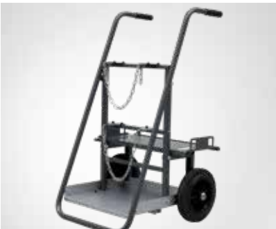
Trolley for mounting and transport of gas cylinder (item number 78857031)