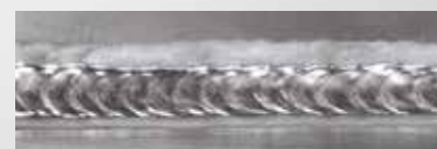
DUO Plus - Aluminium

The function improves control of the weld pool and reduces heat input.