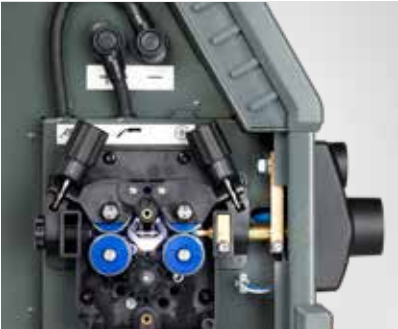
LED light in wire console (item number 78861545)