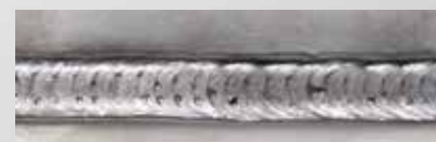
DUO Plus - Stainless steel

DUO Plus optimally preserves the strength of the steel and provides a TIG-like weld appearance.