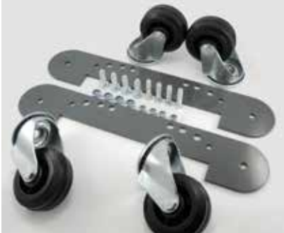
Set of wheels for mounting under protective frame (item number 78861413)