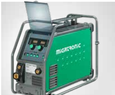
Protective frame (item number 78861506) Here mounted on Omega Yard Pulse.