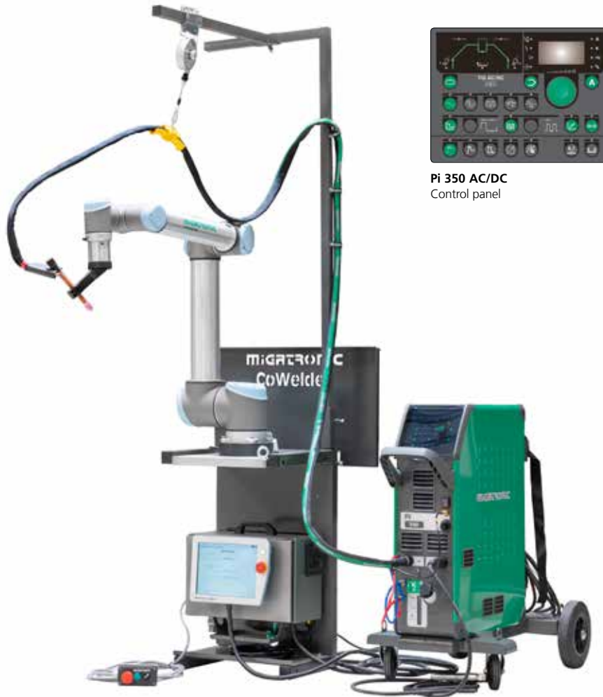
Pi 350 AC/DC Control panel

CoWelder/UR10/Pi 350 AC/DC, IGC®, water-cooled TIG welding machine