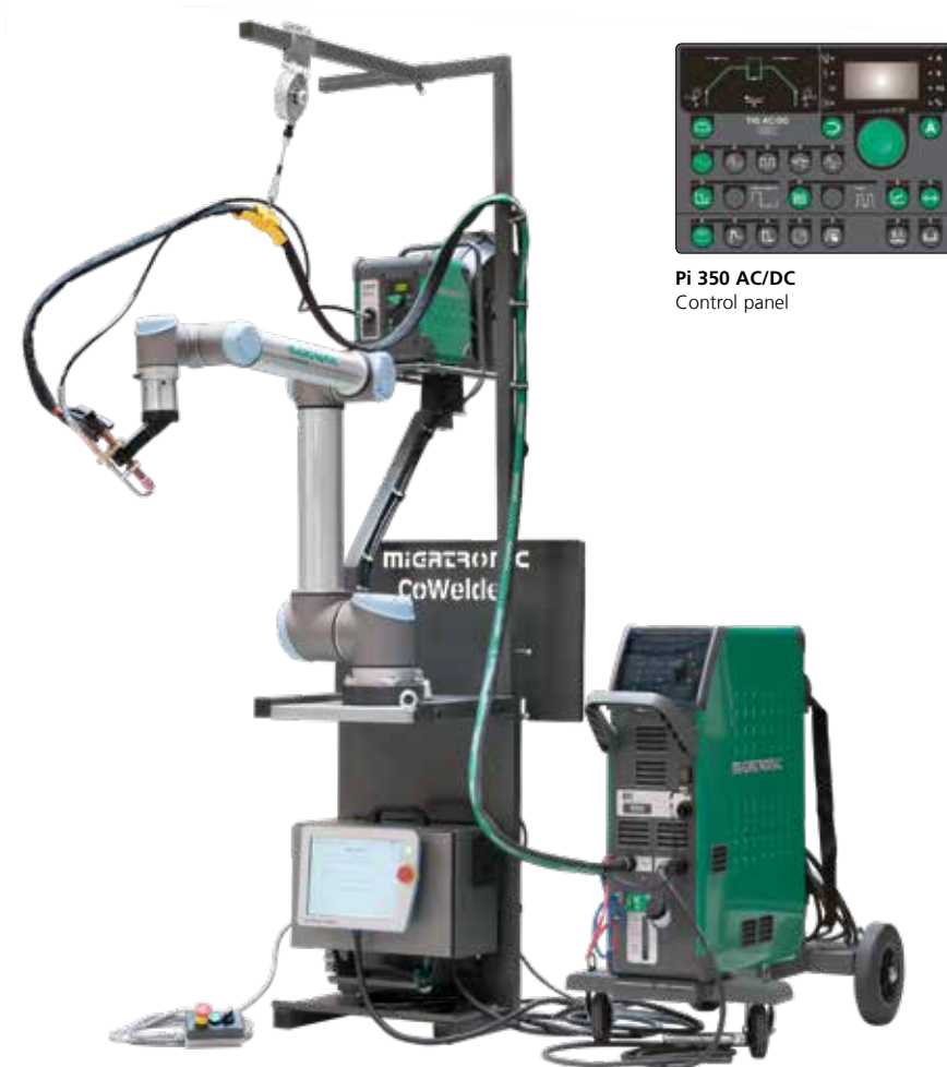
Pi 350 AC/DC Control panel

CoWelder/UR10/Pi 350 AC/DC, IGC®, water-cooled TIG welding machine with CWF