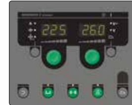
Omega 2 CoWelder 300 Advanced Control panel