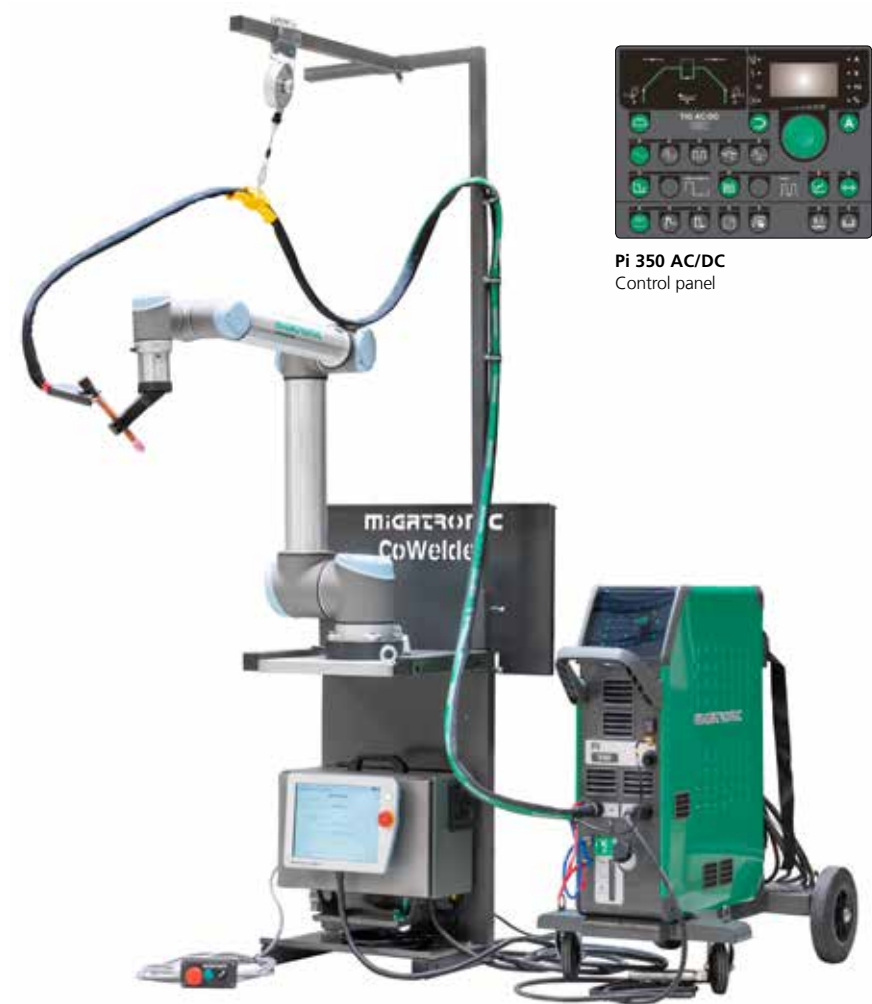
Pi 350 AC/DC Control panel

CoWelder/UR5/Pi 350 AC/DC, IGC®, water-cooled TIG welding machine