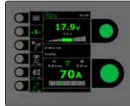
Sigma Select 400 Graphic Control panel

CoWelder/UR5/Sigma Select IAC 400 Synergic water-cooled MIG/MAG welding machine