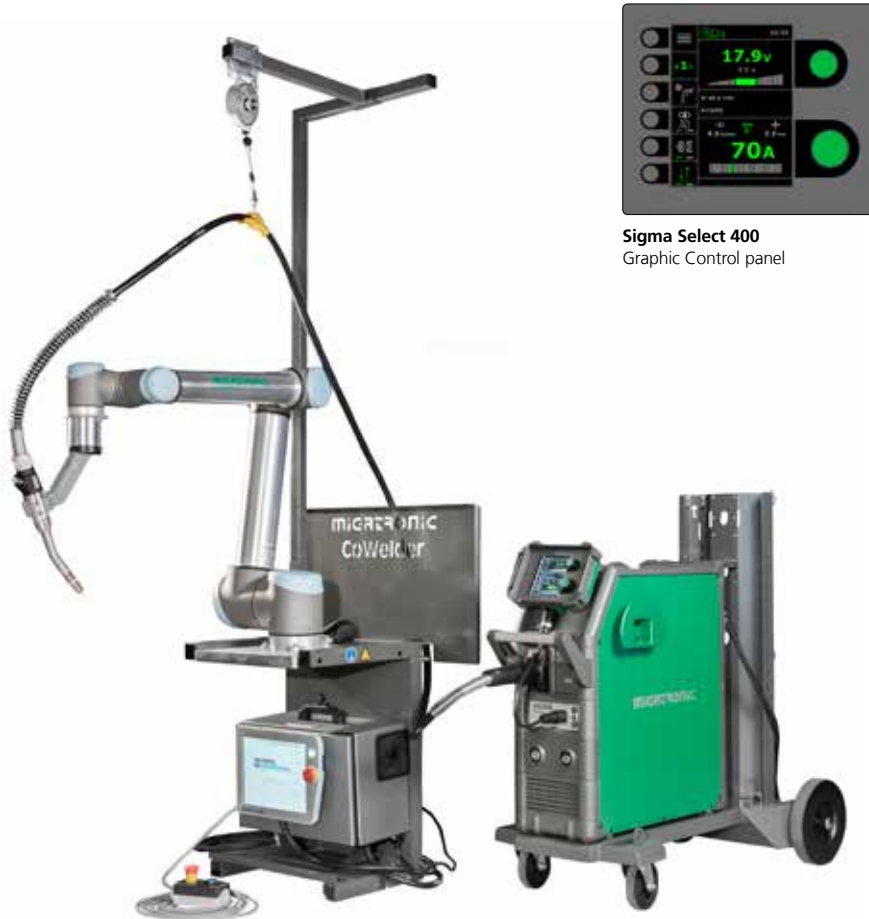
Sigma Select 400 Graphic Control panel

CoWelder/UR10/Sigma Select 400 Synergic air-cooled MIG/MAG welding machine