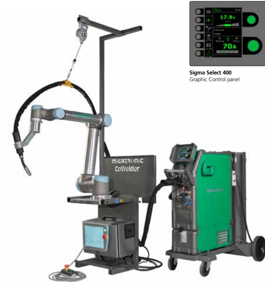
Sigma Select 400 Graphic Control panel

CoWelder/UR10/Sigma Select IAC 400 Synergic water-cooled MIG/MAG welding machine