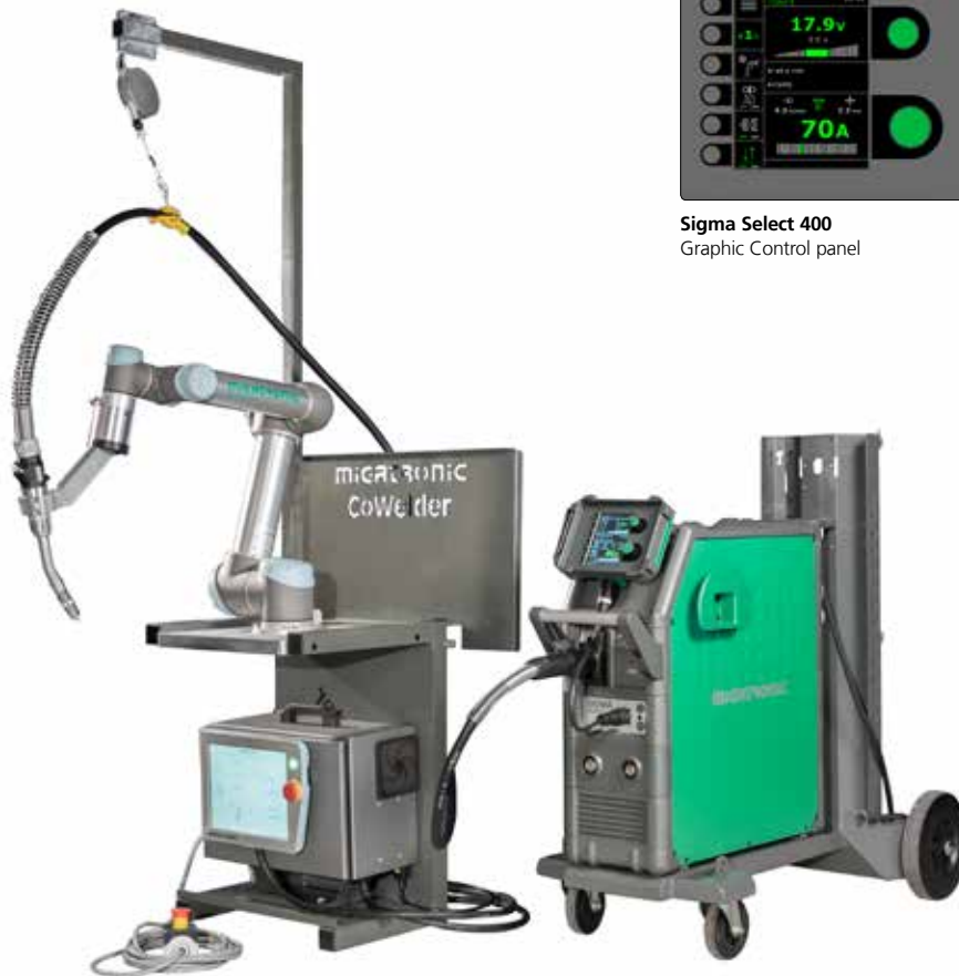
Sigma Select 400 Graphic Control panel

CoWelder/UR5/Sigma Select IAC 400 Synergic air-cooled MIG/MAG welding machine