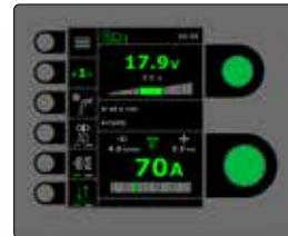
Sigma Select 400 Graphic Control panel