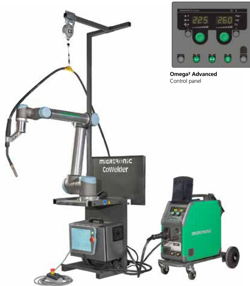
Omega 2 Advanced Control panel

Advanced air-cooled MIG/MAG welding machine