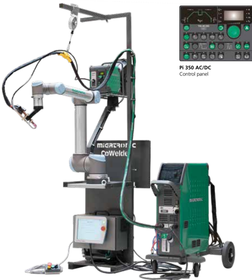
Pi 350 AC/DC Control panel

CoWelder/UR5/Pi 350 AC/DC, IGC®, water-cooled TIG welding machine with CWF