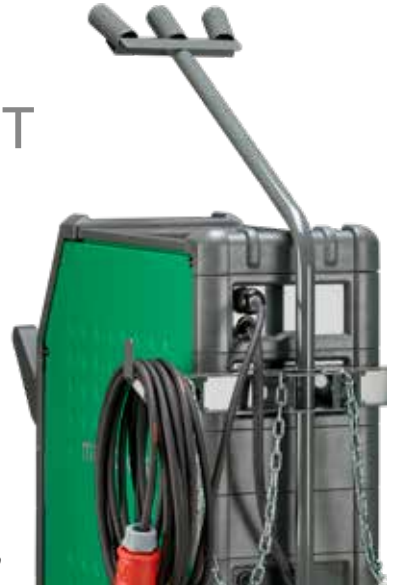
Device for easy coil-up of long cables.

Torch holder. Fitted as standard equipment as illustrated. Optionally available for fitting in the left hand side of the welding machine (item number 78861557)