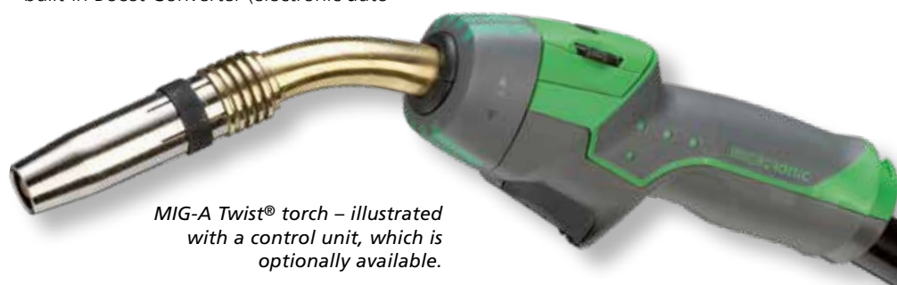
MIG-A Twist® torch – illustrated with a control unit, which is optionally available.

MIG-A Twist® is available in different lengths and with different swan necks. It is configurable with different control units for adjustment of welding current at the torch handle. The control unit is easy to exchange as required – without the use of tools.