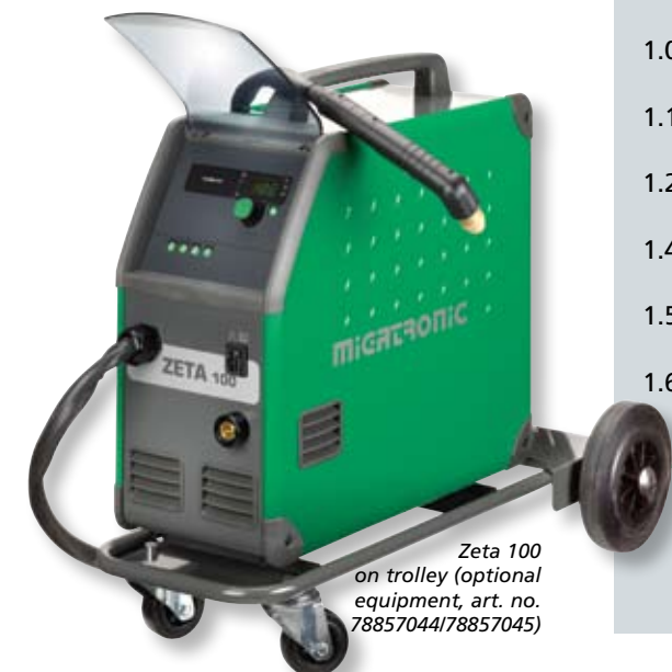
Zeta 100 on trolley (optional equipment, art. no. 78857044/78857045)